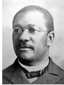
WILLIAM HOOPER COUNCILL