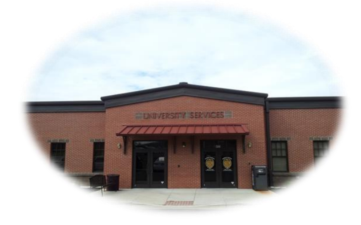
Open 24 hours a day 7 days per week.